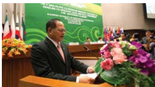
H.E. Mr. Theera Wongsamut Minister of Agriculture and Co-operatives, Thailand

Implicit in the tenets of sufficiency economy is manifold societal capacity building - in sustainable management of natural resources avoiding over exploitation, speculation and greed, utilisation of technology and modern knowledge and skills with a view to strengthen the