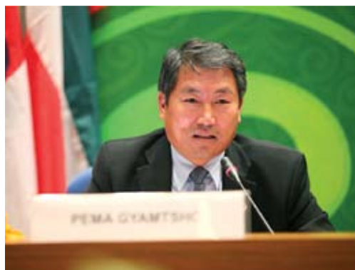
H.E. Dr. Pema Gyamtsho Minister of Agriculture and Forestry-Kingdom of Bhutan

2.7 Honourable Minister Syed Ashrafur Islam , Ministry of Local Government, Rural Development and Co-operatives, Government of Bangladesh gave an account on the current status of co-operatives in Bangladesh and diversified activities in housing, dairy and agriculture. He had drawn the attention to a special feature of rural credit in Bangladesh in the form of competing activities of NGOs and Co-operatives in providing micro credit and other