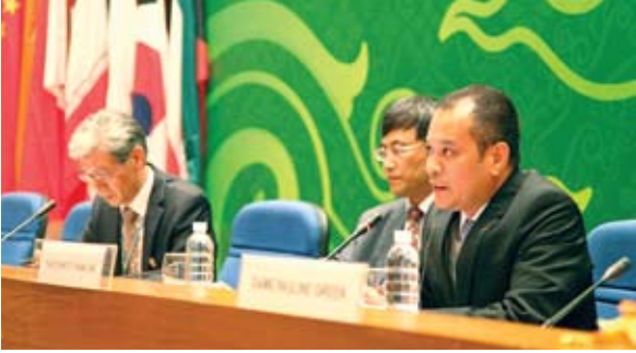
Mr. Nattawut Saikuar, Deputy Minister of Agriculture and Co-operatives, Kingdom of Thailand with the President and Regional Director, ICA Asia Pacific