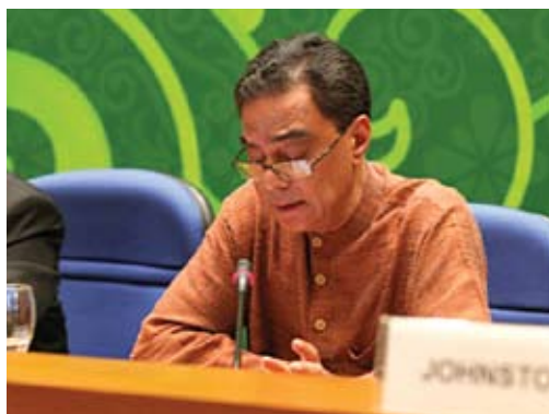
H. E. Syed Ashrafur Islam Minister of Local Government, Rural Development and Cooperatives, Bangladesh

development services for income generation activities. The NGOs in Bangladesh have a vast network and have been funded by foreign donor agencies and because of a flexible charter, the NGOs have been able to mobilize self help groups, especially of women in the below poverty line segment and establish linkage with the banks. Consequently, these two movements launched by co-operatives and NGOs overlap operating under different laws and creating the need for co-ordination, presently lacking in the country. He therefore felt that the two movements could be integrated by a suitable legislation and administrative measures and it is therefore a matter that deserves ICA support.