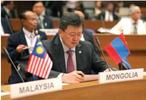
Mr. Enkbold Nyamaa Deputy Speaker and President : Mongolian Parliament and NAMAC

the UN General Assembly which led to the declaration of 2012 as the International Year of the Co-operatives. As 37.7% of people live in villages, the government has formulated policies and laws to promote co-operatives among herders managing livestock and society wise program for co-operative development and is conscious of the need to update the existing legal framework. It has recently approved the law on loan collateral to enable the co-operatives to access cheaper credit and decided to establish one model co-operative in every rural administrative unit and create a system for providing technical assistance to co-operatives and also to encourage the youth to form co-operatives. The formation of the Mongolian National Co-operative Association in 2008 is a step towards Private Public Partnership and collaboration with co-operatives in the region even at this nascent state, Mongolia has ensured formation of Women's Group to take up tree plantation successfully and the co-operatives are growing 2 million saplings annually. Mongolia would be keen to learn about the best international practices through the ICA.