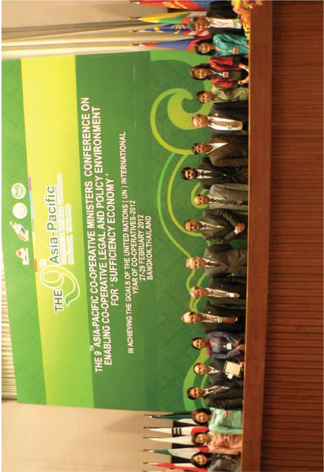
The Deputy Minister of Agriculture, Thailand ; The Regional Director of ICA Asia Pacific and The Director General of Cooperative Promotion Department, Thailand flanked by delegates and staff of the Conference.