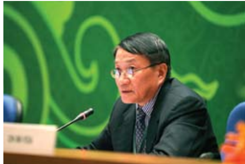
H.E. Dr. Phouang Parisak Pravongviengkham From the Ministry of Agriculture and Forestry, Laos

serving as instruments of mobilising people, savings, capital, credit and reducing costs of production and poverty with the advent of 'Commodity Agricultural Production' aiming at generation of surplus produce for markets-internal and external. There is need for generation of awareness among the co-operatives about food safety and quality standards which call for adoption of efficiency enhancing practices and capacity building of state and co-operative bodies by training in skills. While endorsing the concept of 'sufficiency economy' Vietnam would take initiatives to formulate a policy to encourage co-operatives by incentives in Tax, Credit & Trade Policies and cooperate with ICA in promoting growth of vibrant co-operatives and especially agricultural co-operatives.