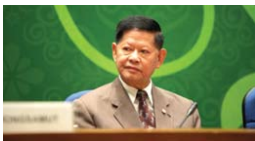
H.E. Mr. Chumpol Silpa-Archa Deputy Prime Minister- Thailand

1.0 The theme of the conference attended by 300 delegates from member countries of the Asia Pacific region was “Enabling Co-operative Legal and Policy Environment for Sufficiency Economy” which underscored imperatives for co-operatives-the need to create an enabling legal and policy environment for formation, growth and development of co-operatives as strategic sector in the economy and society and the relevance of the philosophy of sufficiency economy propounded by His Excellency King of Thailand to co-operative movement as of now and future as it reflects the co-operative values and principles in the spirit of sustainable development.