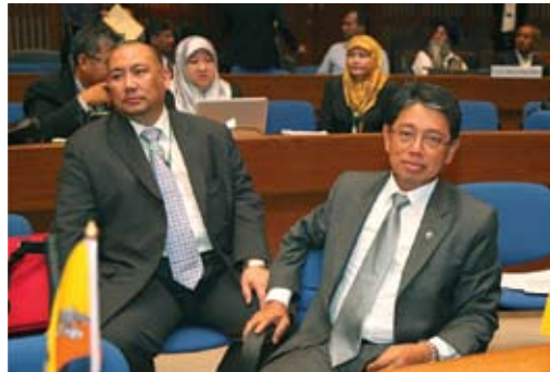
H.E. Mr. Yang Berhormat Pehin Orang kaya Seri Utama Mudim Dato Paduka Haji Bakar, Minister of Industry and Primary Resources, Brunei

the UN General Assembly which led to the declaration of 2012 as the International Year of the Co-operatives. As 37.7% of people live in villages, the government has formulated policies and laws to promote co-operatives among herders managing livestock and society wise program for co-operative development and is conscious of the need to update the existing legal framework. It has recently approved the law on loan collateral to enable the co-operatives to access cheaper credit and decided to establish one model co-operative in every rural administrative unit and create a system for providing technical assistance to co-operatives and also to encourage the youth to form co-operatives. The formation of the Mongolian National Co-operative Association in 2008 is a step towards Private Public Partnership and collaboration with co-operatives in the region even at this nascent state, Mongolia has ensured formation of Women's Group to take up tree plantation successfully and the co-operatives are growing 2 million saplings annually. Mongolia would be keen to learn about the best international practices through the ICA.