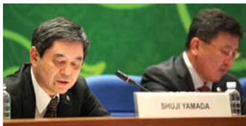
H.E. Mr. Shuji Yamada, Vice Minister of Agriculture, Forestry and Fisheries, Japan

2.0 Honourable Vice Minister, Mr. Shuji Yamada , Ministry of Agriculture Fisheries and Forests, Japan informed the conference that the Government of Japan had been able to ensure that all food exports from Japan including processed foods, are totally sanitized and there was no cause for any apprehension about contamination from radioactivity