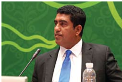
H.E. Mr. Johnston Fernando Minister for co-operatives, Sri Lanka

co-operatives in providing essential supplies to the consumers in the long periods of civil conflict and in rendering invaluable services in Health, Medical, Education, Transport, Agricultural Credit, inputs, marketing and other