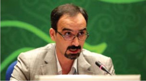
FARDA Co-operative, Iran