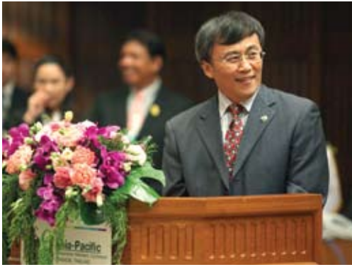
Mr. Li Chunsheng President- ICA Asia Pacific

use of resources by a continuous process of exchange of materials and their reuse and recycle for production as well as consumption for achieving efficiency with low levels of resource waste and pollution. The concept makes environment central to development and seeks to resolve development vs environment debate by establishing the sustainable profitability of circular economy reflecting the validity of the co-operative principles and the scope of integrating renewable sources of energy in this model which has been adopted by the All China Federation of Supply and Marketing Co-operatives. It has 31 provincial federations, 343 prefecture federations, 2369 county federations and 21,602 primary co-operatives and ACFSMC system runs 760,000 business service outlets in 2011 and has a turn-