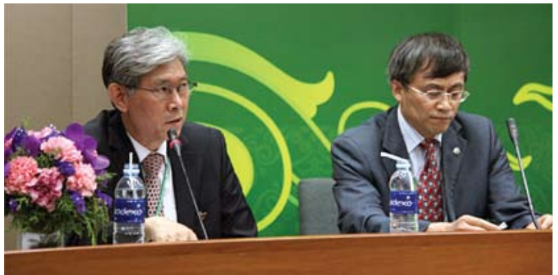
Regional Director ICA-AP