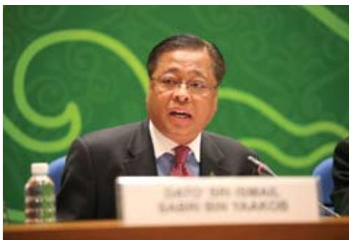
H.E. Mr. Dato Sri Ismail Sabri Bin Yaakob Minister of Domestic Trade, Co-operatives and Consumerism

2009 and establishment of the Department of Agricultural Marketing and Co-operatives in 2010 provided the legal & administrative framework of growth of co-operatives. Like the philosophy of sufficiency economy Bhutan has propounded the concept of Gross National Happiness as the basis of development measured in terms of moderation in behaviour and human development and not based only material factors as under GDP usually followed to assess a country's development. This led to adoption of happiness as the 9th Millennium Development Goal by the UN General Assembly in its 109th Plenary Session on 19.7.2011. Bhutan considers co-operatives as one of the means of achieving the goal of national happiness and therefore suggested addition of happiness to the ICA Principles of Co-operative Identity.