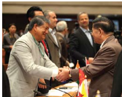
H.E. Mr. Harish Rawat Minister Of Agriculture for State – India

2.12 H.E. Shri Harish Rawat , Minister of State for Agriculture and Cooperation India traced the spurt in growth of co-operatives in India with the advent of planned economic development after attainment of independence in 1947 and informed that as of now there are 0.59 million co-operative societies engaged in diverse activities with a total membership of 248.20 million persons covering 97% of 600,000 villages of India and 71% of rural households—making India’s co-operative sector largest in the world and providing employment to 16.69 million people. He highlighted the role of dairy co-operatives in bringing about ‘White Revolution’ and turning