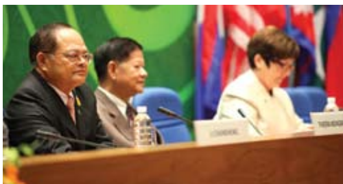
(L-R) Minister of Agriculture, Thailand; Deputy Prime Minister of Thailand and the President of ICA

1.2 Dame Pauline Green , President ICA reminded the conference about the underplayed yet highly significant role of co-operatives in the global economy as a socio-economic force and that they contain 1 billion members whereas the total number of share holders of all companies listed in the stock exchange was only 327 million and the annual net worth of 300 globally successful co-operatives is about $1.6 trillion. She regretted that the potential of co-operatives as an instrument for mitigation of climate change and conservation of environment is yet to be recognised in the Rio + 20 Preparatory meetings though ICA had campaigned for its inclusion in the agenda and would continue the effort. In this back-